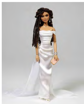
Not baby steps...but doll-sized steps

So, when Barbie release these dolls, and young girls go into toy stores and see them lining the shelves, dolls with the same colour skin as them; dolls with the same dreadlocks as them; dolls who represent them - consider the message it gives them. The franchise that makes dolls that are supposedly an embodiment of society's ideals of perfection has made a doll that actually looks like them. It teaches them that they way they look and the way they represent themselves is perfect. It's reassuring them that they are just as beautiful as anyone else, and that all of their features are worthy of society's approval.