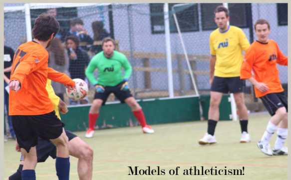
Models of athleticism!