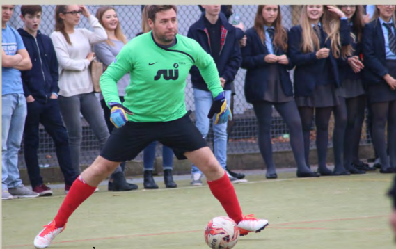
Pryor's shock at the wrong shaped ball