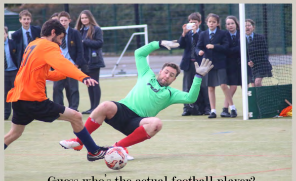
Guess who's the actual football player?