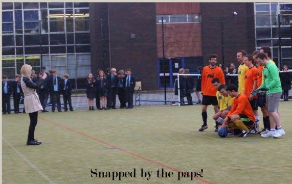
Snapped by the paps!