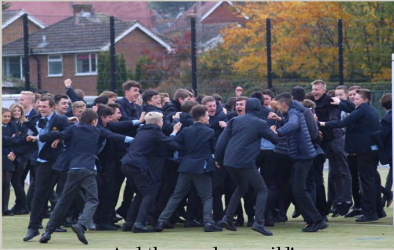
And the crowd goes wild!